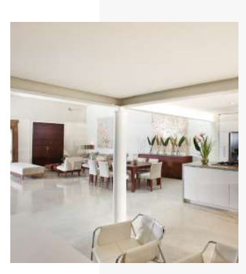
Homes without walls for more flexibility

From Mexico to Miami . fever Real Esta overview