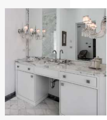
Homes without walls for more flexibility